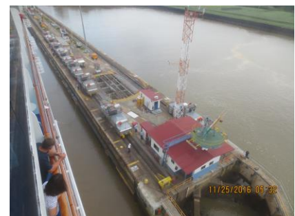
Transiting Mira Flores Lock