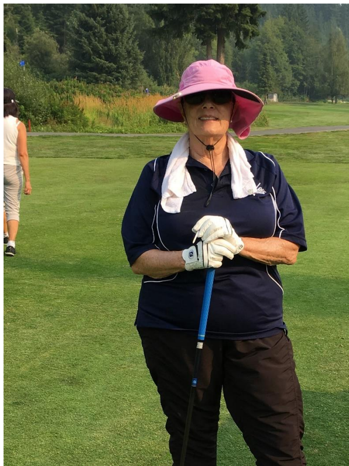
Playing the famous course at Whistler!