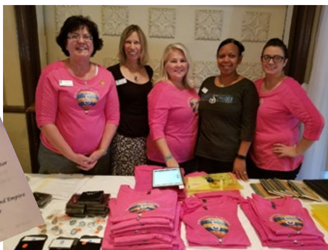
Souvenir from our first meeting this year